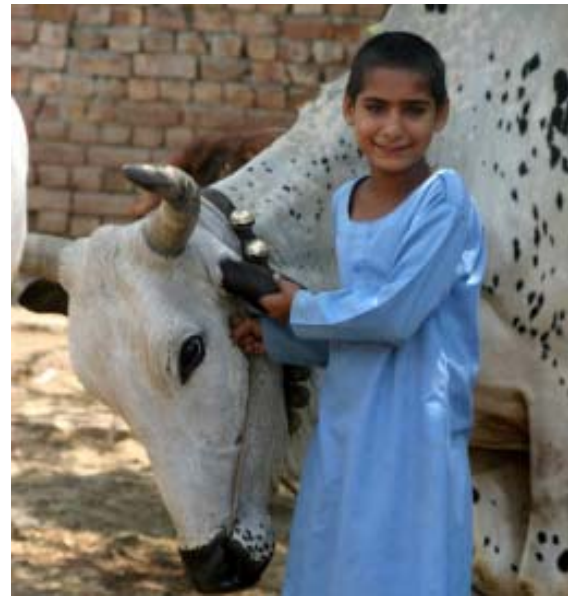
Boy with Water Buffalo.

Traditional humanitarian assistance activities provide commodities selected by donors and are often based on surplus items in a "supply-driven system." Our programs are driven by the needs of the recipients. The Rotarians of Lahore Garrison have met with the villagers frequently, conducted needs assessments, and together have selected the items to be shipped.