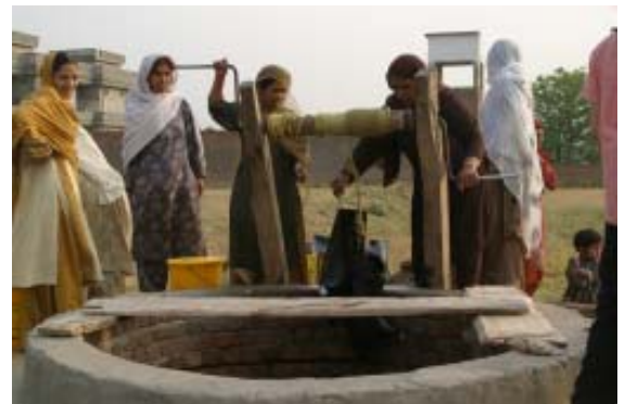
Women at the Well.

Bottom line: A perpetual Fund for Improving the Village. $27K seed money from Capital Region Rotary District 7190 . . . . . . generates $7K annually . . . . . . that the Village RCC can use . . . . . . for sewing machines, bicycles, school supplies, drinking water, health clinics, and so on, . . . . . . . . forever . . . . .