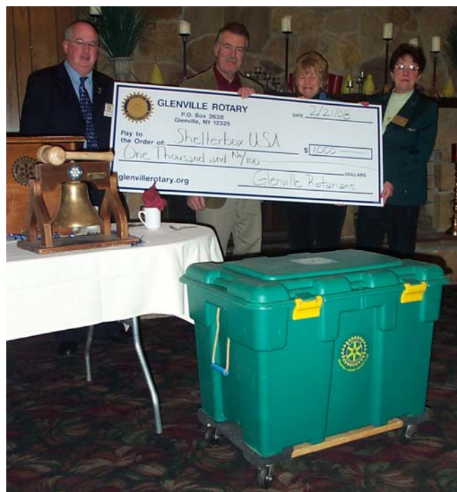
Glenville Rotary presented Shelter Box with a check for $1000 from their Amazing Castle Fund Raiser