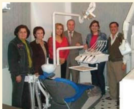
Members of the Rotary Club of Sahel Aley and Ladies League of Chowiefat deliver equipment to the free dental clinic in Chowiefat, Lebanon.

About 75 percent of the 150,000 people living in Chowiefat, Lebanon, and surrounding towns are poor or have below-average incomes. A